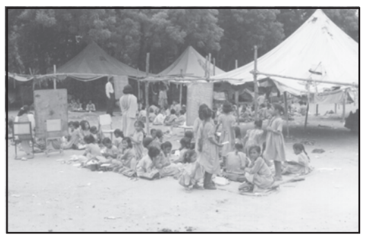
Discuss the visuals (Two types of schools)

For the sociologists who perceive society as unequally differentiated, education functions as a main