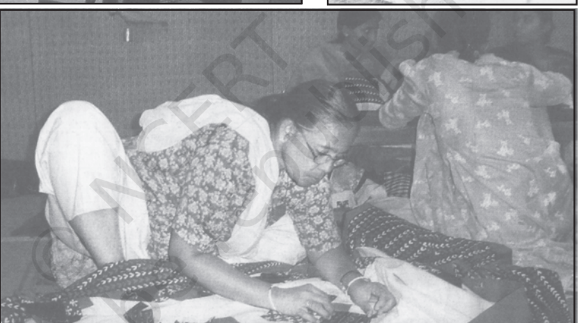
Different Types of Work

physical effort, which has as its objective the production of goods and services that cater to human needs.