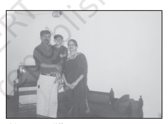
Notice how families and residences are different