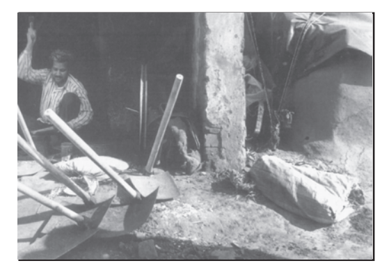
Work and Home