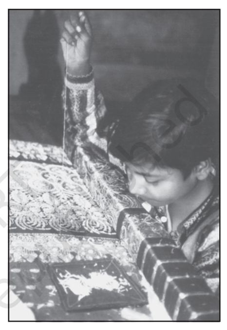
Discuss the visual

The report indicates how gender and caste discrimination impinge upon the chances of education. Recall how we began this book in Chapter 1 about a child's chances for a good job