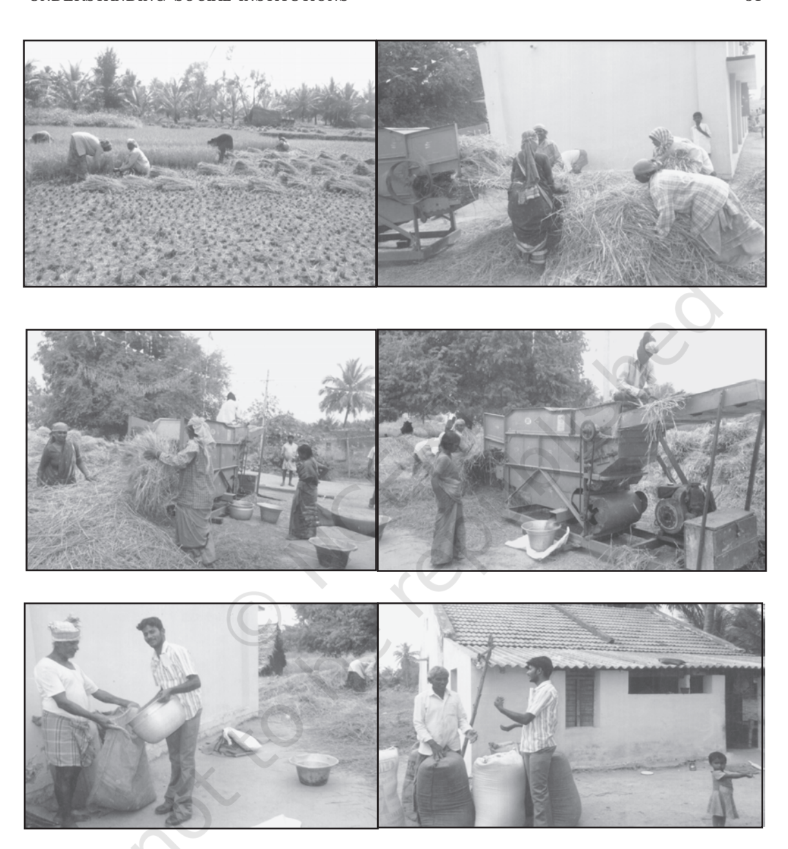
Threshing of paddy in a village